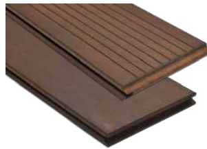
V-Groove / Brushed (reversible)