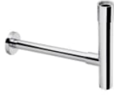
1 1/4" outlet connector for basin. 300 Pipe